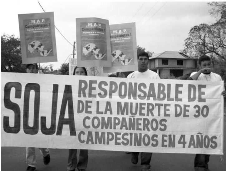
Protest against RTRS conference in Paraguay, August 2006